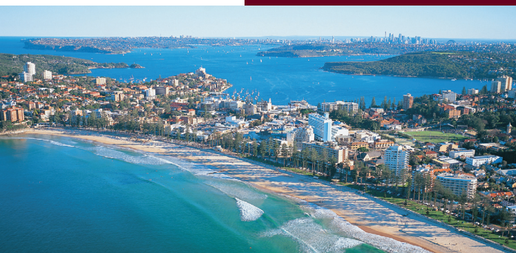
Manly to the City (Manly Council)