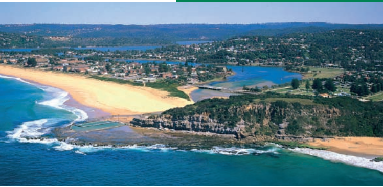
Narrabeen Head and Lakes