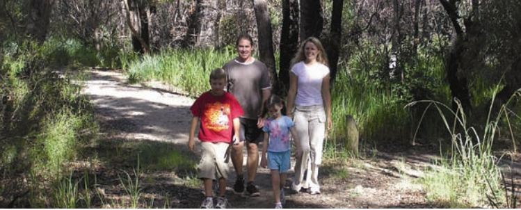
Walking in Manly Dam Reserve (Warringah Council)